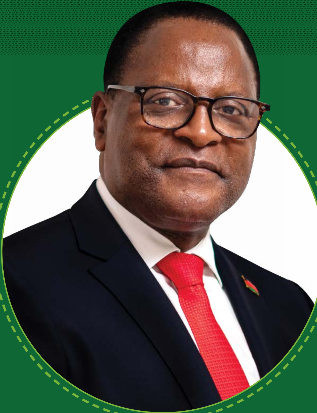
DR. LAZARUS MACCARTHY CHAKWERA PRESIDENT OF THE REPUBLIC OF MALAWI